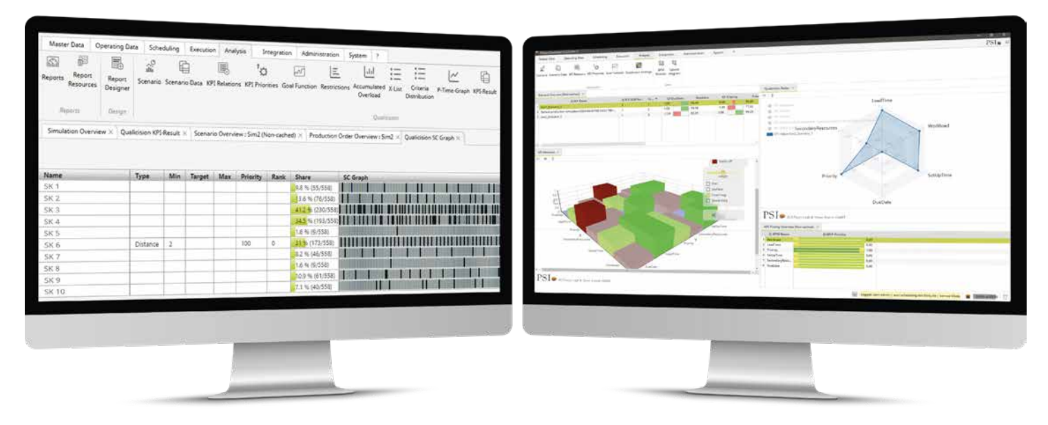
Figure 2: Qualicision AI Framework—Sequencing with order property distribution and scheduling with 3D KPI relationship matrix, KPI viewer, KPI preference settings.

teraction is potentially the basis for a further key figure that can be incorporated as a KPI in the Qual-