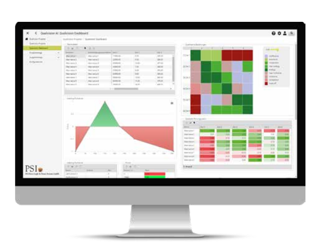
Figure 1: Qualicision AI Framework—Web GUI with Qualicision AI labeling function and impact matrix.

If data streams and the associated KPIs are now time-stamped and con-